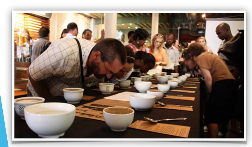
Cupping / evaluating